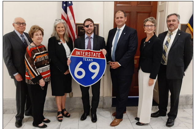
I-69 wall sign presentation to freshman Congressman Dan Crenshaw of Houston during the September I-69 DC Fly-In