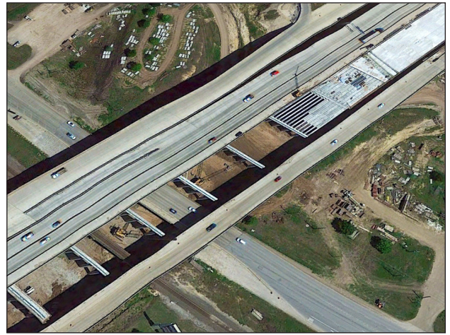
2019 construction of new I-69 bridges in Fort Bend County